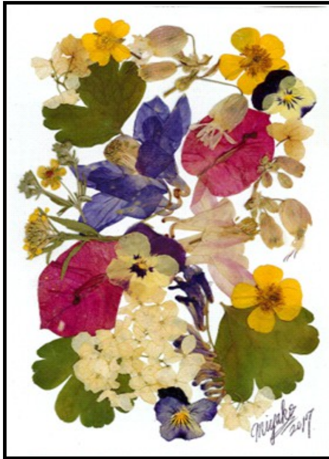
Flower collage by Miyako, 2017