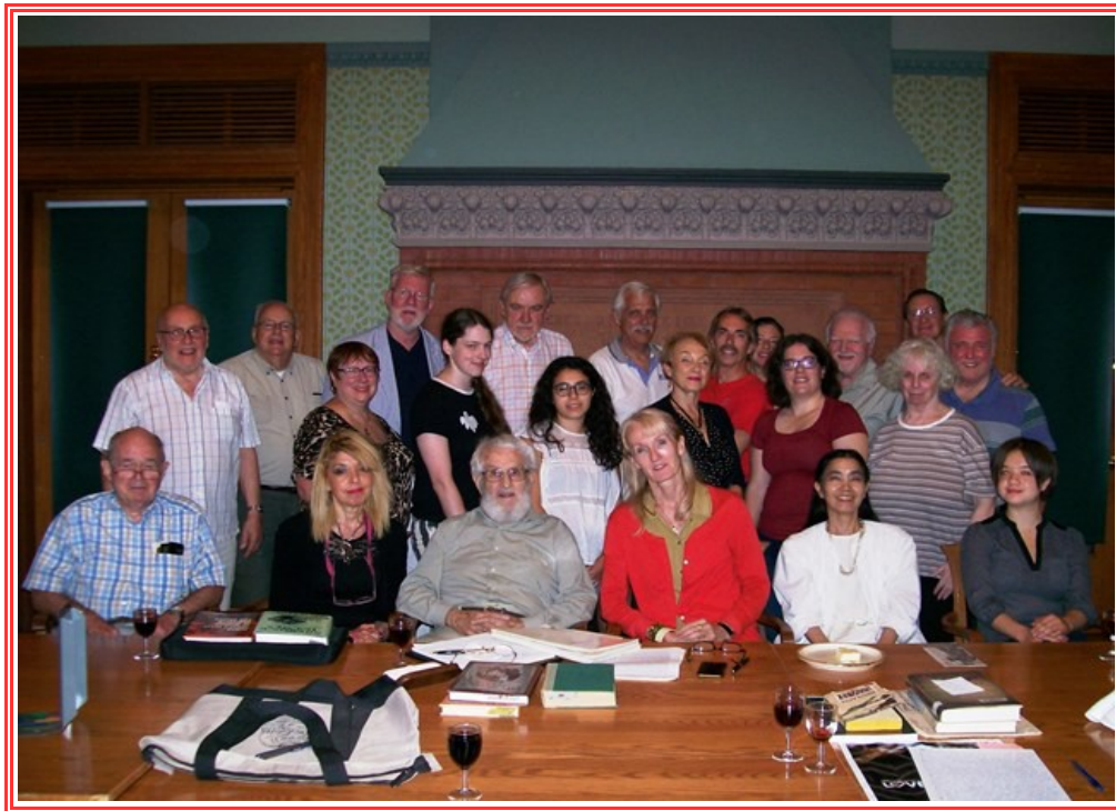
Bimetallic Question members and guests.

The testament to longevity of the Bimetallic Question has been the keen enthusiasm exhibited by members young and old, men and women, to connect, to share to listen and to participate in a living, active, growing literary Society. I feel so lucky to belong to this Society of friends. May it continue and flourish long after I am gone. For these reasons I have decided to withdraw this proposal and enjoy the great works of all our great members.