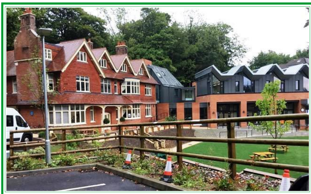
Undershaw, July 2017.