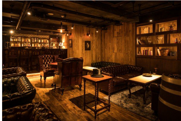
Sherlock House in Tokyo’s Ikebukuro District

This elegant bar, with its 19 th -century English style, is a big hit with ladies who want to experience Victorian England’s atmosphere. Japanese Sherlock Holmes fans claim that Holmes loved whiskey and soda; therefore, they’re serving Dewar’s Scotch whisky and soda. Also, is roast beef Holmes’s favourite? In this bar, they serve “Deluxe Roast Beef Sandwiches.” To me, Holmes was basically a gaunt man who actually didn’t care very much for food. I think Holmes ate whatever Mrs Hudson served, aside from his occasional visits to restaurants, parties, and so on. Anyway, I hope that Holmes fans from Canada will visit Sherlock House in Tokyo when you visit Japan! And I wonder if anyone in Montréal might open the same type of bar here??