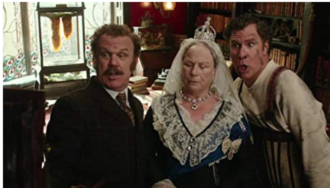
Watson (Reilly), Victoria (Ferris), and Holmes (Ferrell) try to take a selfie.