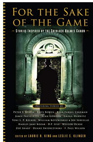
Cover of For the Sake of the Game